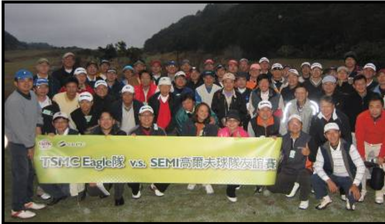
Friendship golf game with TSMC Team