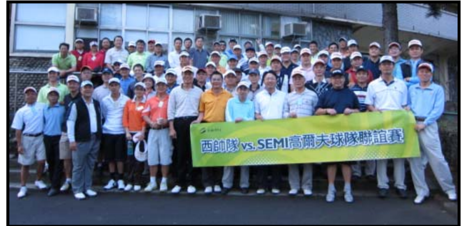
Friendship golf game with UMC Team